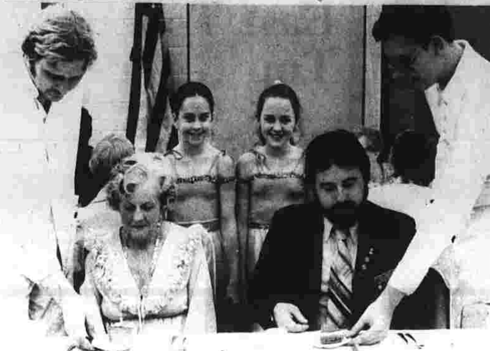
Students Prepare Dinner