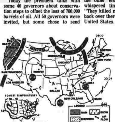
For period ending 7 a.m. EST 11/17/79. During Friday night, rain or showers will be found throughout most of the Pacific coast states while some snow falls in the vicinity of the lower Lakes region.